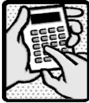
Learn what QuickBooks has to offer!

During this introductory course, you will work with a sample company and learn firsthand the many features QuickBooks Pro has to offer. While working with the provided sample company, you will add customers and vendors, write checks, balance checking accounts, pull and customize financial reports, and much, much more. In addition, you will set up a mock company from scratch and witness firsthand how a company is created in QuickBooks and how decisions made during setup affect how the program works for your organization.