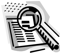
Learn how to get more from your QuickBooks program!

During this advanced course you will work with a sample company and learn firsthand the more advanced features contained in QuickBooks Pro. While working with the provided sample company, you will learn how to set up and work with 'splits', the necessary accounts for any assets owned by the organization, tracking and making use of payroll reports, how the inventory feature works, the idea behind the accountants review copy, tax reporting, and much, much more. This course is meant for those individuals who have taken the QuickBooks Pro Basic course or have worked with QuickBooks Pro. There will be an opportunity to answer any specific questions and/or solve problems as time allows during the course.