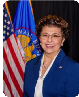
Administrator Jovita Carranza

The U.S. Small Business Administration (SBA) is offering designated states and territories low-interest federal disaster loans for working capital to small businesses suffering substantial economic injury as a result of the Coronavirus (COVID-19).