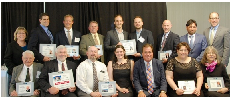
Small Business Week Honorees May 3, 2016