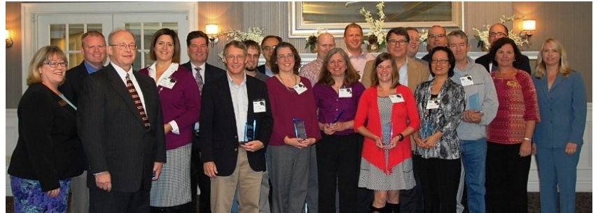
Pictured at right: The 2016 NH Emerging Leaders Graduating Class

In April the NH district office launched its first Emerging Leaders program in Manchester. Sixteen small business owners completed the seven-month federal training initiative that specifically focuses on executives of businesses poised for growth. The no-cost program includes 100+ hours of professional specialized training and peer-to-peer counseling over the term of the program. Plans are underway for recruitment of the class of 2017.