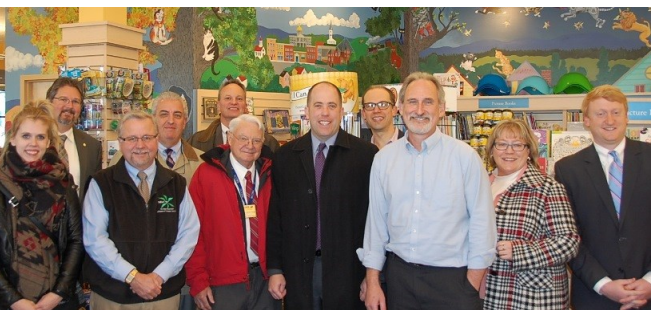
Small Business Saturday Promotion "Shop Local" Concord