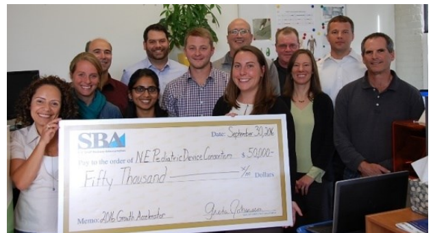
Growth Accelerator Fund Competition Prize Winner New England Pediatric Device Consortium